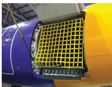
Baggage door net (Prototype shown on Q400)

i NOTE: Due to comparable dimensions of BDF and SD Bombardier Q400 aircraft doors, both doors are supplied with the same barrier door net (Part No 244CA29).