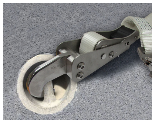
Deck Link Fitting/ Bracket