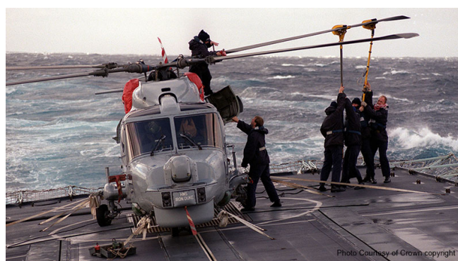
Lynx being held in place by the MC1