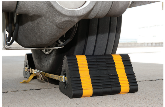
Storm chock shown here used on Lufthansa aircraft

Drallim Industries supply a range of rugged and reliable wheel chocks used by both Civil and Military operators.