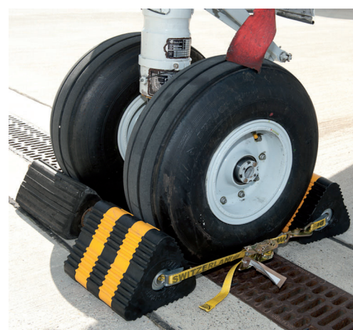
Drallim Storm chock shown along side original chock used by Lufthansa

For all enquiries please contact: sales@drallim.com Tel: +44(0)1424 205140