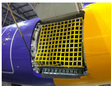
Baggage door net (Prototype shown on Q400)

i NOTE: Due to comparable dimensions of BDF and SD Bombardier Q400 aircraft doors, both doors are supplied with the same barrier door net (Part No 244CA29).