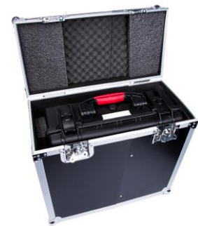
Set of 4 current cables with TTA clamps