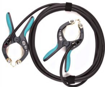
Current connection cable with TTA clamps