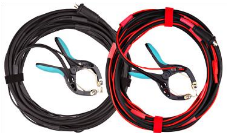
Current and Sense cables with TTA clamps