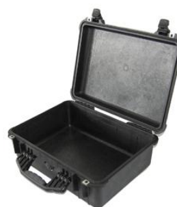
Cable plastic case