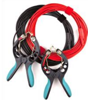
Voltage Sense cables with TTA clamps