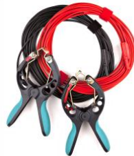
Voltage Sense cables with TTA clamps