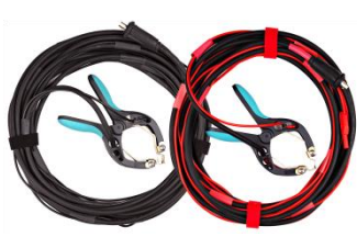
Current and Sense cables with TTA clamps

All specifications herein are valid at ambient temperature of + 25 °C and recommended accessories. Specifications are subject to change without notice. Specifications are valid if the instrument is used with the recommended set of accessories