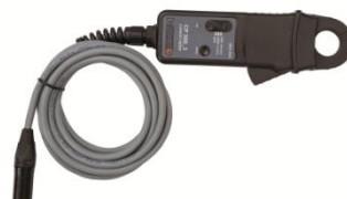
Current clamp 30/300 A with extension 5 m (16.4 ft)