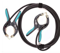
Current connection cable with TTA clamps