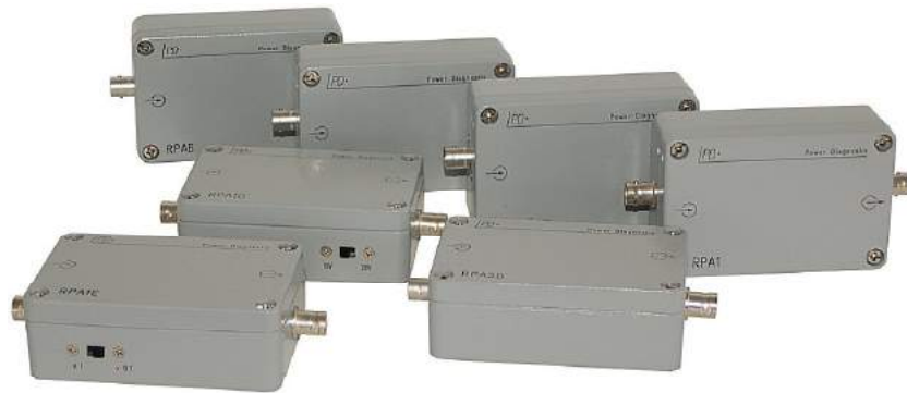
Some preamplifiers of the RPA series

Preamplifiers serve to condition, filter, and amplify the partial discharge signal to be measured. Because the frequency range in which PD signals are measured is strongly dependent on the preamplifier used, proper selection of a preamplifier is an important part of noise mitigation and can have a strong effect on the appearance of the partial discharge pattern itself.