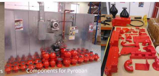
Components for Pyroban