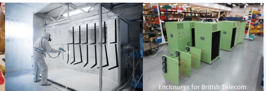
Enclosures for British Telecom