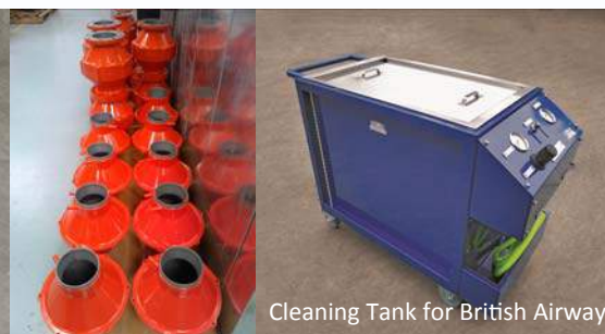
Cleaning Tank for British Airways