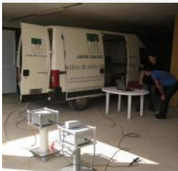
ICMflex & HV filter