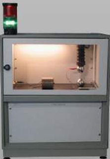
HV test cabinet

Depending on the needs the instruments and controls can be compiled in different versions: