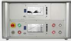
Control and measurement unit