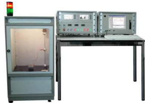
Typical test set